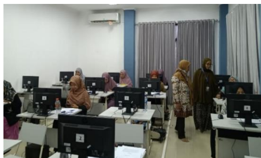
Figure 2. Material and practice in Microsoft Word and Excel

The third implementation stage is the socialisation of the basic operations of Microsoft Office. Socialisation was done at two different times, as described in the activity below. The team gave explanatory and practical Microsoft Word and Excel materials at the first meeting. This training activity was attended by 10 participants and was held on Friday, October 28, 2022, from 13.00 to 19.00 WIB at the Al Biruni Kindergarten Building, as shown in Figure 2.