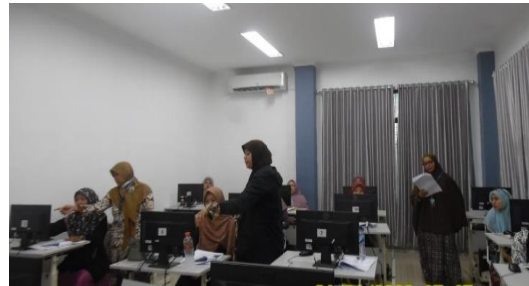
Figure 3. Material and practice in Microsoft PowerPoint

was proven that in a relatively short time, the participants could understand Microsoft Office and Excel Operation materials which were expected to facilitate the implementation of school activities. Computer training using Microsoft Office applications for teachers can simplify the process of teaching and learning activities and increase teacher professionalism (Fadli et al., 2021). The materials we provided explained Microsoft PowerPoint materials and practices at the second meeting. This training activity was attended by 10 participants and was held on Saturday, October 29, 2022, from 10.00 to 12.00 WIB at the Al Biruni Kindergarten Building, as shown in Figure 3.